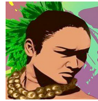
Image Release. I understand that PIVA may take photographs or videotape, or arrange for videocasts or podcasts of the Festival. I hereby grant PIVA, its successors, assignees, licensees, and sponsors the exclusive right to use Minor's image, name, event participation, hometown, face likeness, voice and appearance at the Festival, in advertising and promoting related to PIVA without reservation or limitation. I waive any right to inspect or approve any advertising or promotional materials containing Minor's image.

Supervision: A chaperone (age 21 or older) is required to attend the Festival with participants under the age of 18. The chaperone will be responsible for supervising the participants under the age of 18 at all times.